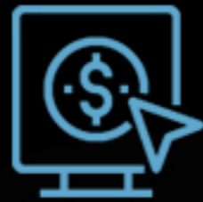
NFT Sales and Royalties